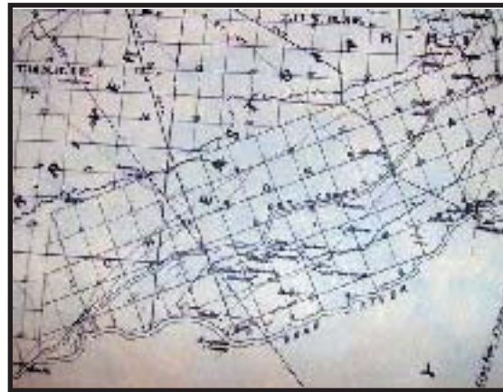
Johnson's Rancho, Camp Far West, Lofton, and Kempton's Crossing

“Whiskey is to drink. Water is to fight over. History is to be savored”