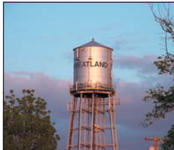
Wheatland - Incorporated in 1874

Originally formed on January 17, 1974, the Wheatland Historical Society is a non-profit 501(c)3 organization dedicated to the protection, preservation and dissemination of information about sites, artifacts, pictures and documents that are important to the history of the greater Wheatland area including the old Johnson Rancho and surrounding areas of South Yuba County.